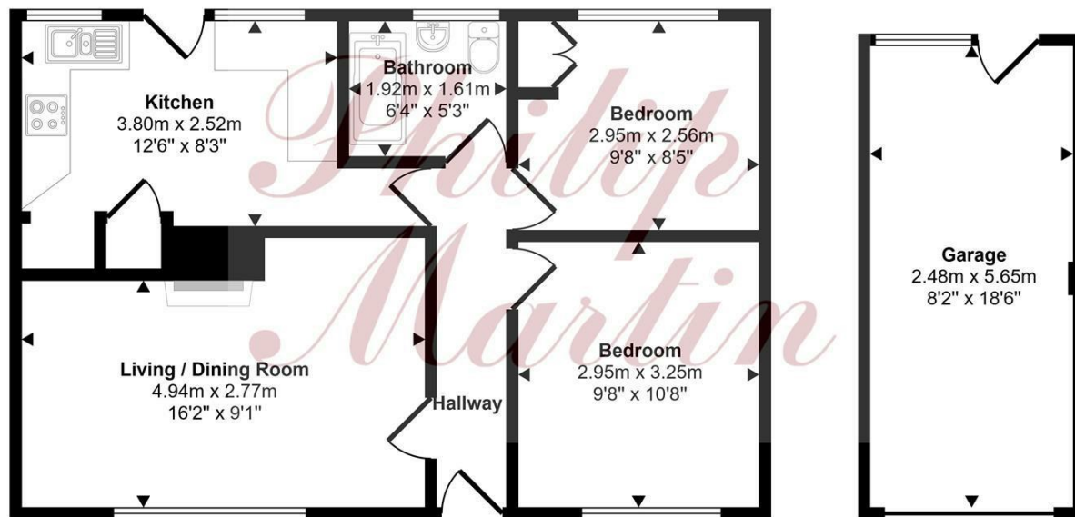
Floorplan Approx 54 sq m / 578 sq ft

Approx Gross Internal Area 68 sq m / 729 sq ft